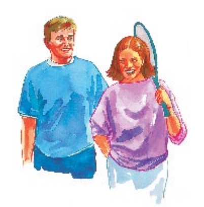
Learn to laugh and enjoy wholesome times together.

Comment: Overdoing will ruin your marriage. So will underdoing. Work, love, rest, exercise, play, worship, meals, and social contacts must be carefully balanced in your marriage, or something will snap. Overwork and the lack of sleep, proper food, or exercise make a person critical, intolerant, and negative. Constant overeating is a great evil that strengthens the lower nature and dulls the conscience. Sexual abuses destroy a love for holy things and weaken vitality. Marriage gives no license to sexual excesses. Degrading, twisted, or intemperate sex acts destroy love and