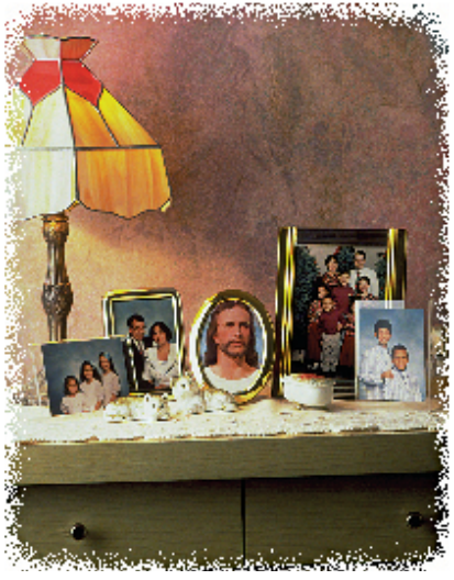
With Christ in your hearts and home, marriage will be successful.

Comment: This is the greatest rule. It really covers all the others. Put Christ first! The real secret of true happiness in the home is not diplomacy, strategy, and untiring effort to overcome problems, but rather, union with Christ. Hearts filled with Christ's love can never be very far apart. With Christ in the home,