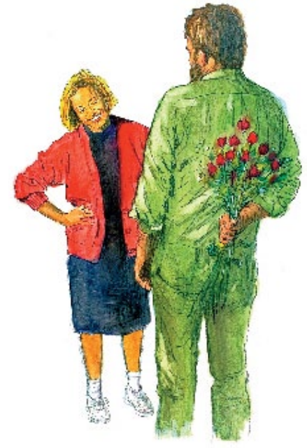
Surprise each other with little gifts.

love" each other. Don't take more out of marriage than you put into it. Divorce itself is not the greatest destroyer of marriage, but rather, lack of love. Given a chance, love always wins.