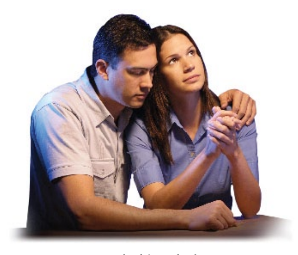
Pray aloud for each other.

marriage will be successful. The gospel is the cure for all marriages that are filled with hatred, bitterness, and disappointment. It prevents thousands of divorces by miraculously restoring love and happiness. It will save your marriage, too, if you are willing.