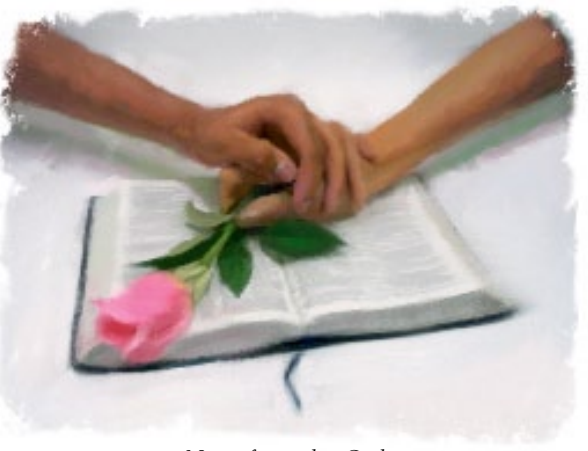
Never forget that God Himself joined you in marriage.

marriage. Keep love growing by expressing love for one another or it will die, and you will drift apart. Love and happiness are not found by seeking them for yourself, but rather by giving them to others. So spend as much time as possible doing things together if you would get along well. Learn to greet each other with enthusiasm. Relax, visit, shop, sightsee, eat together. Don't overlook the little courtesies, encouragements, and affectionate acts. Surprise each other with little gifts or favors. Try to "out-