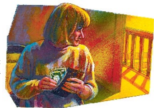
Do not tamper with each other's wallets or other personal property without permission.

degree. Marriage partners do not own each other and should never try to force personality changes. Only God can make such changes, and we shall all answer personally to Him on this matter (Romans 14:12). Perfect confidence and trust in one another—no checking up on each other—is absolutely essential for happiness. Spend less time trying to "figure out" your spouse and more time trying to please her or him. This works wonders.