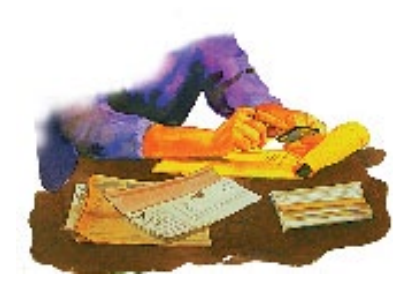
Discuss and agree in money matters.

Comment: All possessions and income in marriage should be "ours," not "yours" and "mine." Wives who don't work outside the home should receive a regular amount for groceries, clothing, and other budgeted items. It should be cheerfully provided instead of grudgingly released under protest. Wife and husband both should have small, equal sums (whenever possible) to spend as desired without giving account. A miserly husband usually angers his wife into being a spender, just as a wasteful husband makes a wife stingy. Showing confidence in your companion's managing ability will usually make him or her more businesslike.