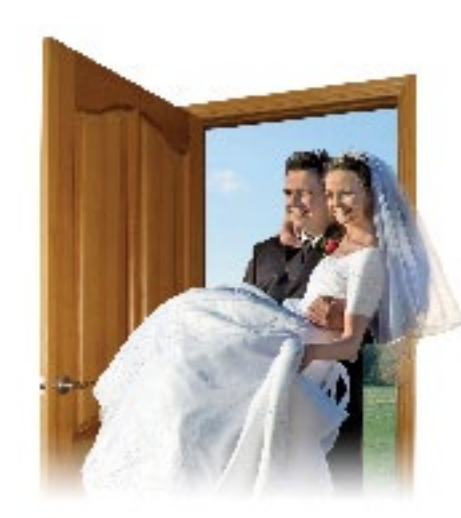
Establish your own home, even if it must be a one-room apartment.