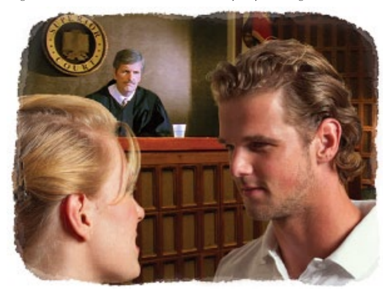
Forgiveness is always better than divorce.

reason Iesus ruled it out. Divorce is always destructive and almost never a solution to the problem. Instead, it creates much greater problems, so it should never be considered. Torn, frustrated, unhappy, twisted lives almost inevitably follow divorce, and even success in life itself is often thwarted. God instituted marriage to guard people's purity and happiness, to