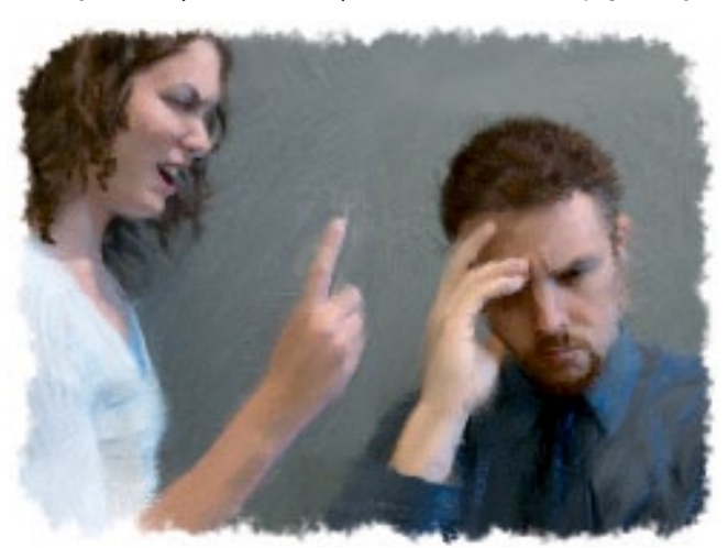
Harsh, angry words crush your spouse's desire to please you.

"A soft answer turns away wrath, but a harsh word stirs up anger" (Proverbs 15:1). "Live joyfully with the wife whom you love" (Ecclesiastes 9:9). "When I became a man, I put away childish things" (1 Corinthians 13:11).