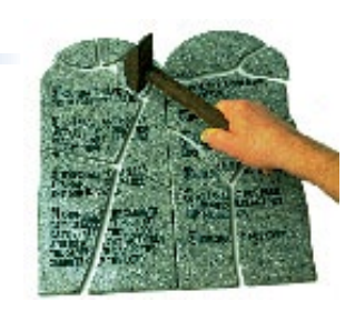
God says that sin is breaking His law.

Answer: Sin is breaking God's Ten Commandment law. And since the law of God is perfect (Psalm 19:7), its principles cover every conceivable sin. It is impossible to commit a sin that is not condemned by at least one of God's Ten Commandments. The commandments cover "man's all [the whole duty of man]" (Ecclesiastes 12:13). Nothing is left out.