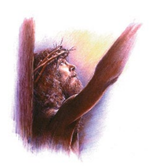
The cross is positive proof that the law is unchangeable.

Answer: Absolutely not! The Bible is very clear on this point. If the law could have been changed, God would have immediately made that change when Adam and Eve sinned instead of sending His Son to die in the sinner's behalf to pay the penalty of the broken law. This was impossible. The commandments are revealed principles of God's holy character that will always be true as long as God exists.