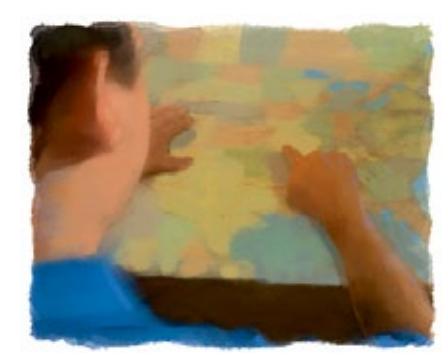
God's law is His road map to happy, abundant living.

Special Note: The eternal principles of God's law are written deep in every person's nature by the God who created us. The writing may be dim and smudged, but it is still there. This means, of course, that you cannot find true peace unless you are willing to live in harmony with your inner nature, upon which God has written these principles. We were created to live in harmony with them. When we choose to ignore them, the result is always tension, unrest, and tragedy—just as ignoring the rules for safe driving leads to serious trouble.