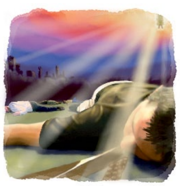
The wicked will be slain at Jesus' second coming.

Answer: The wicked will be slain by Jesus.