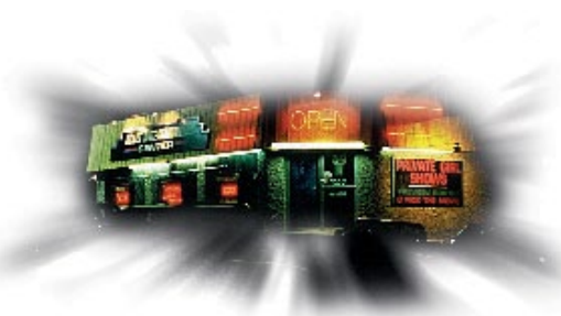
An epidemic of pornography, crime, illegal drugs, and moral degeneracy is threatening to overwhelm us.