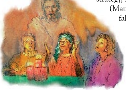
What appears to be Jesus in a séance chamber is one of Satan's impersonating demons.