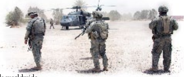
Strife between nations is a sign of Jesus' second coming.

Only Jesus' soon coming will bring an end to the pain and destruction of war.