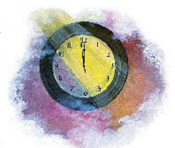
We are living in the final moments of time.

Answer: The Bible is very specific and plain on this point. The signs have almost all been fulfilled. We cannot know the exact day and hour of Christ's return (Matthew 24:36), but we know that He is coming soon. God has promised to finish things very quickly now