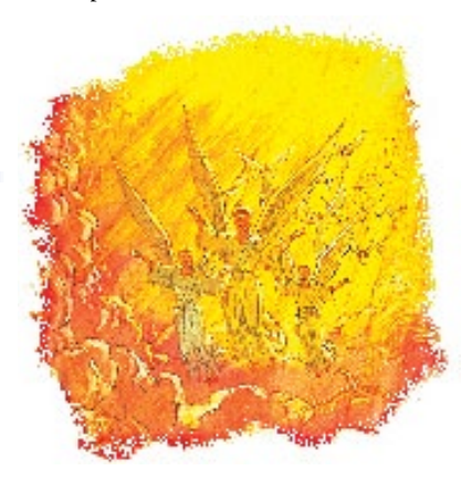
All the angels of heaven will be with Jesus at His second coming.

Answer: All the angels of heaven will come with Jesus at His second coming. As the cloud nears the earth, Jesus will send His angels, and they will quickly gather together all of the righteous people in preparation for the trip back to heaven (Matthew 24:31).