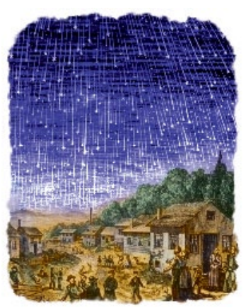
The great star shower took place on Nov. 13, 1833.

Fulfillment: The great star shower took place on the night of November 13, 1833. It was so bright that a newspaper could be read on the street. One writer says, "For nearly four hours the sky was literally ablaze."* Men thought the end of the