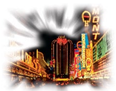
Most end-time people will love pleasure more than God.

"This gospel of the kingdom will be preached in all the world as a witness to all the nations, and then the end will come" (Matthew 24:14).