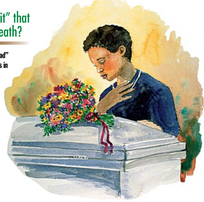
There is nothing mysterious about the spirit that returns to God at death. It is the breath of life.

Answer: The spirit that returns to God at death is the breath of life. Nowhere in all of God's book does the "spirit" have any life, wisdom, or feeling after a person dies. It is the "breath of life" and nothing more.