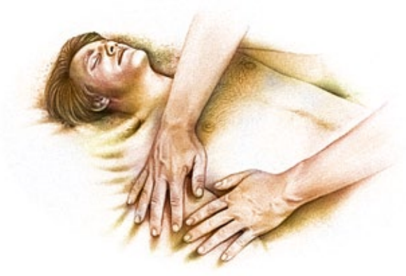
Adam was created by God in the beginning.