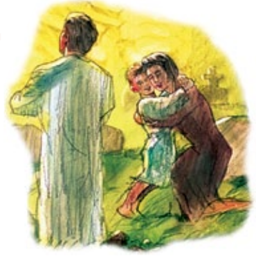
The righteous will be raised to life and given immortality at Jesus' second coming.

Answer: They will be rewarded. They will be raised, given immortal bodies, and caught up to meet the Lord in the air. There would be no purpose in a resurrection if