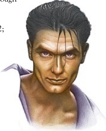
Those who believe the dead are alive become easy targets for the devil's deceptions.

Posing as godly loved ones who have died, saintly clergymen who are now dead, Bible prophets, or even the apostles or disciples of Christ (2 Corinthians 11:13), Satan and his angels will deceive billions. Those who believe the dead are alive, in any form, will most assuredly be deceived.