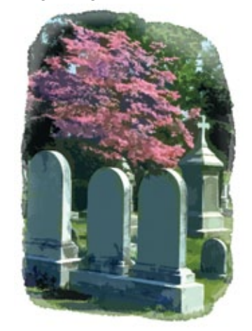
The spirits of both the righteous and the wicked return to God. Their bodies return to dust.

Answer: God made us from dust in the beginning.