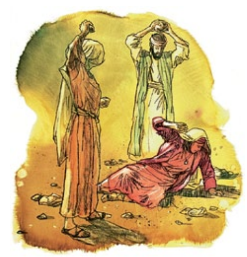
In Moses' day, people who claimed power to communicate with the dead were stoned to death.