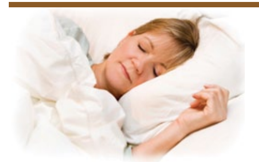
Jesus calls death "sleep." It is a state of total unconsciousness.

"So man lies down and does not rise. Till the heavens are no more" (Job 14:12). "The day of the Lord will come ... in which the heavens will pass away" (2 Peter 3:10).