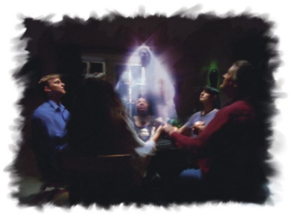
Though millions think it is possible, the dead cannot communicate with the living.

Answer: No, the dead cannot contact the living, nor do they know what the living are doing. They are dead. Their thoughts have perished (Psalm 146:4).