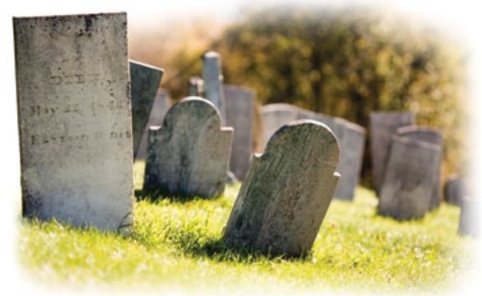
Reincarnation is impossible because God says all who have died, both good and evil, are in their graves.

devils, working miracles" (Revelation 16:14) and posing as spirits of the dead will be able to deceive and lead them astray virtually 100 percent of the time (Matthew 24:24).