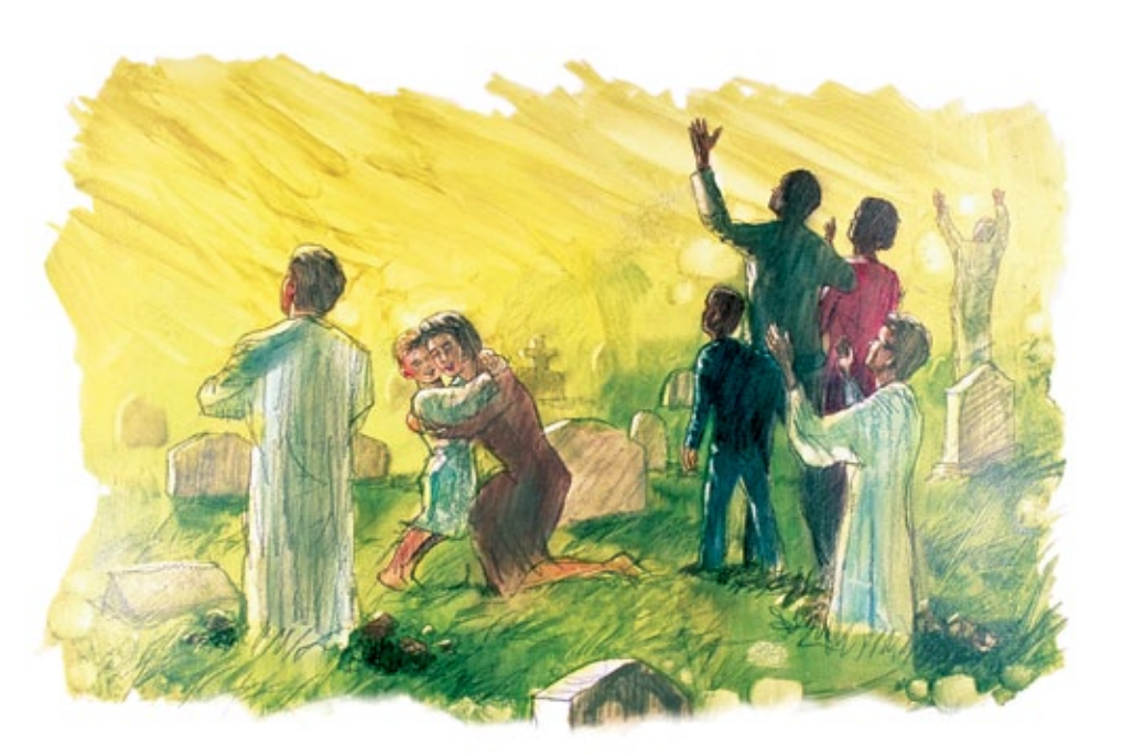
No one in God's new kingdom will ever die. Death will cease at the destruction of Satan.