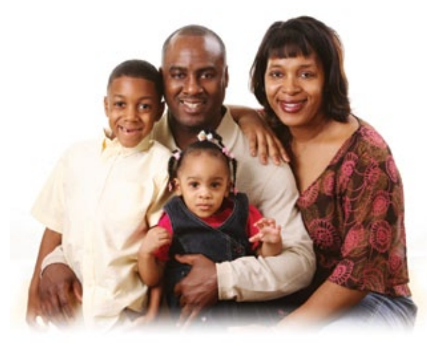
These four people are four souls.