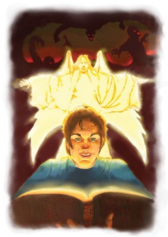
The elect will not be deceived, because they firmly reject everything that is contrary to Scripture.

Answer: God's people will know from their earnest study of His book that the dead are dead, not alive. Spirits of the dead do not exist. Therefore, God's people will reject all miracle workers and teachers who claim to receive special "light" or work miracles by contacting the spirits of the dead. And God's people will likewise reject as dangerous and false all teachings that claim the dead are alive in any form, anywhere.