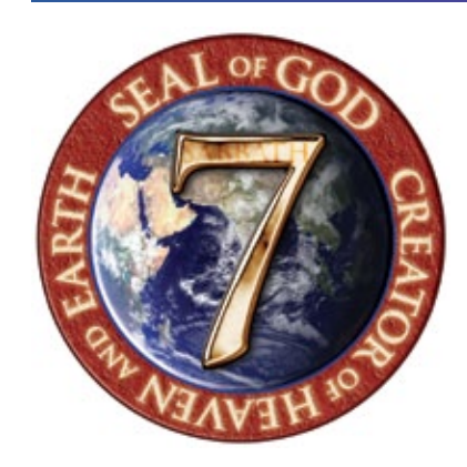
The Sabbath is the sign, or mark, of God's power.

"I also gave them My Sabbaths, to be a sign between them and Me, that they might know that I am the LORD who sanctifies them" (Ezekiel 20:12). "It is a sign between Me and the children of Israel forever; for in six days the LORD made the heavens and the earth" (Exodus 31:17). 'And he received the sign of circumcision, a seal of the righteousness of the faith which he had while still uncircumcised, that he might be the father of all those who believe, though they are uncircumcised, that righteousness might be imputed to them also (Romans 4:11)