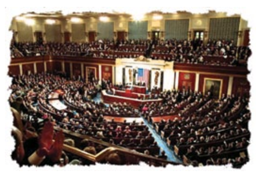
When laws are passed forcing Sunday worship, those who comply will receive the beast's mark.

Those who follow Jesus and obey His truth will keep His Sabbath day holy and receive His mark. Those who expect to refuse the beast's mark in the future must step under Jesus' Sabbath banner now. His