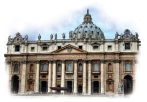
More than 100 nations have state representatives at the Vatican.

Since its healing, the strength of the papacy has grown and increased until today she is one of the most powerful religio-political organizations and influence-centers in the world. Malachi Martin, consummate Vatican insider and intelligence expert, reveals the following in his best-selling book The Keys of This Blood <sup>5</sup> (page numbers in parentheses):