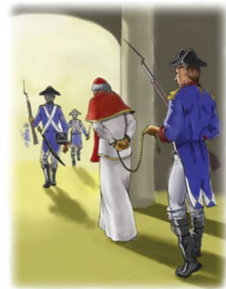
General Berthier inflicted a deadly wound upon the papacy by taking Pope Pius VI captive.

We will quote just two supportive references from history, though there are many: (1) "The Roman Church ... pushed itself into the place of the Roman World-Empire, of which it is the actual continuation. ... The Pope ... is Caesar's successor." (2) "The mighty Catholic Church was little more than the Roman Empire baptised. Rome was transformed as well as converted. The very capital of the old Empire became the capital of the Christian Empire. The office of Pontifex Maximus was continued in that of Pope." So this point also fits the papacy. She received her capital city and power from pagan Rome.