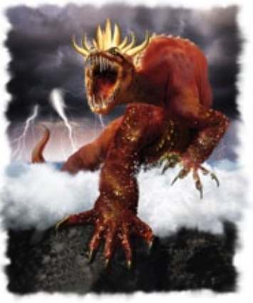
The beast of Revelation chapter 13 symbolizes the antichrist.

Do some of these points have a familiar ring? Certainly! We encountered many of them earlier when we studied about the antichrist in Daniel chapter 7. The "beast" of Revelation 13 is simply another name for the "antichrist," which we learned from Daniel 7 is the papacy. Prophecies of Daniel and Revelation often cover the same ground as prior prophecies, but each time new features are added that help make the prophecies certain. So expect to learn some new things about the antichrist from this Study Guide. Now let's consider, one by one, the 11 points that describe the beast.