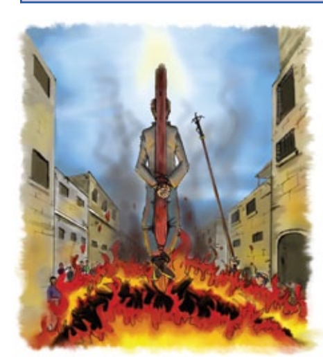
Millions of Christians lost their lives during periods of papal persecution.

The American ambassador says the Vatican is unmatched as a "listening post" (120). The Vatican knows by Saturday what will happen on Monday anywhere in the world (439). Papal structure is prepared for worldwide rule now (143). Obviously, the wound is healing and the eyes of the nations are upon the Vatican, so this point also fits the papacy.