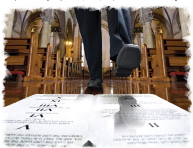
God requires His people to stop trampling upon His holy day.

Notice that the third angel of Revelation 14:9-12, who brings the message about the mark of the beast, speaks with a loud voice also (verse 9). The message is too important to treat as ordinary. It's a life-or-death issue. Jesus says His sheep, or people, will follow Him when He calls them (John 10:16, 27).