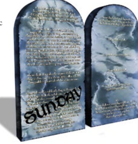
Changing Sabbath to Sunday involves altering God's law—a very serious matter.

Here is another Catholic statement: "The Church is above the Bible; and this transference of Sabbath observance from Saturday to Sunday is proof positive of that fact." <sup>10</sup>