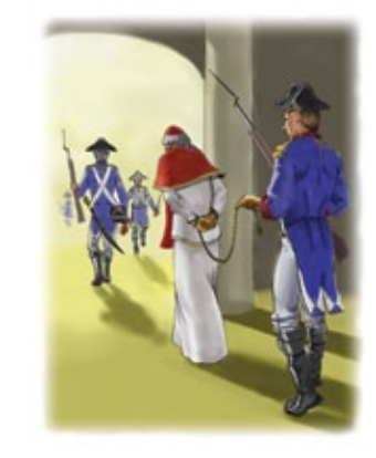
In 1798, General Berthier inflicted a deadly wound upon the papacy when he took the pope captive.

Answer: The Bible predicted that the papacy would lose its world influence and power at the end of the 42 months. This prophecy was fulfilled in 1798, when Napoleon's General Berthier took the pope captive and the papal power received its deadly wound. (For the full details, see Study Guide 15.)