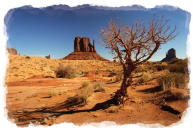
Prophecy predicted that the United States would arise from a sparsely settled area.

Answer: This nation arises "out of the earth" instead of out of the water as did the other nations mentioned in Daniel and Revelation. We know from Revelation that water symbolizes areas of the world that have a large population. "The waters which thou