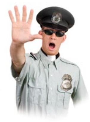
Apostate religion and civil government will unite in the end time to force people's consciences.

B. "Causeth the earth and them which dwell therein to worship the first beast, whose deadly wound was healed" (Revelation 13:12). The United States will lead the nations of the world in forcing worship of, and allegiance to, the papal antichrist. The issue is always worship. Who will you worship and obey? Will it be Christ your Creator