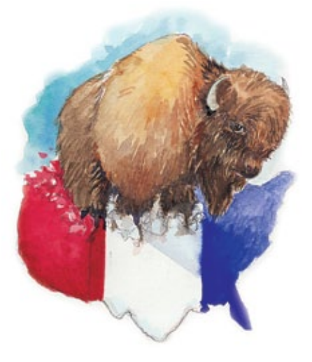
The beast of Revelation 13:11-18 symbolizes the United States.

Answer: The papal captivity mentioned in verse 10 took place in 1798, and the new power (verse 11) was seen emerging at that time. The United States declared its independence in 1776, voted the Constitution in 1787, adopted the Bill of Rights in 1791, and was clearly recognized as a world power by 1798. The timing obviously fits the United States. No other power could possibly qualify.