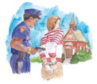
The United States in the end time will force people to either worship or be punished.

Answer: As we learned in Study Guide 20, the dragon is Satan, who works through various governments of the earth to establish his evil kingdom and crush God's church by persecuting and destroying His people. Satan's aim always has been to usurp God's power and throne and to force people to worship and obey him. (See