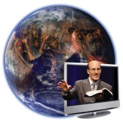
In the last days of earth, God's end-time message of hope will reach every person.

14. While interest in the counterfeit revival heightens, what will be happening to the genuine worldwide revival sponsored by God's end-time people?