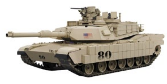
The United States is the world's number one military power.

A. "[The United States is] the planet's sole remaining superpower." "The U.N. Obsession," Time , May 9, 1994, p. 86.