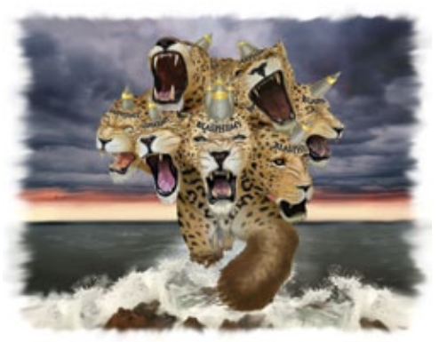
The beast of Revelation 13:1-10 symbolizes the papacy.