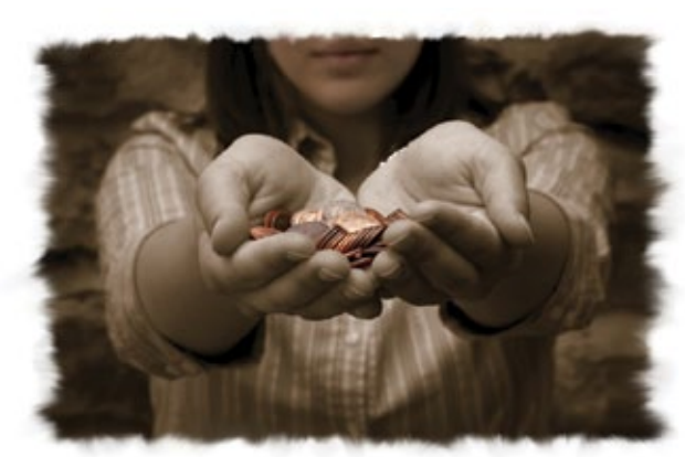
The Bible does not specify the amount to be given for offerings.