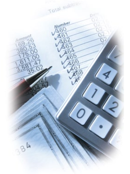
When a person tithes, God stretches the remaining nine-tenths so there is always enough.