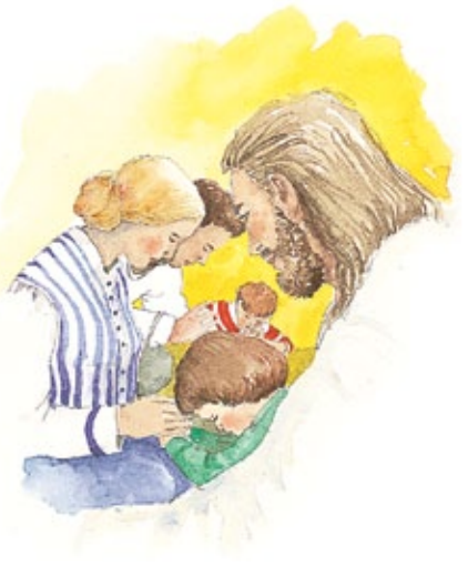
Giving ourselves to the Lord should be our first priority.

We return tithe to God, to whom it already belongs. We give offerings. Offerings are voluntary and should be given joyously.