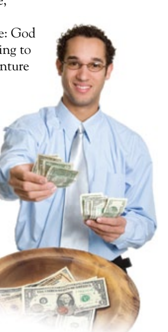
God's people gladly give offerings as an expression of their love for Him.

Answer: The Lord asks us to give offerings for His work as an expression of our love for Him