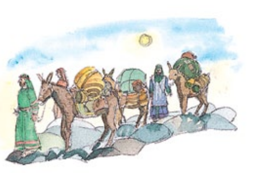
Love caused God's people in Macedonia to give very liberally to the faminestricken Christians in Jerusalem.

Note: If we truly love Jesus, giving sacrificially for His work will never be a burden, but rather a glorious privilege that we will perform with great joy and satisfaction.