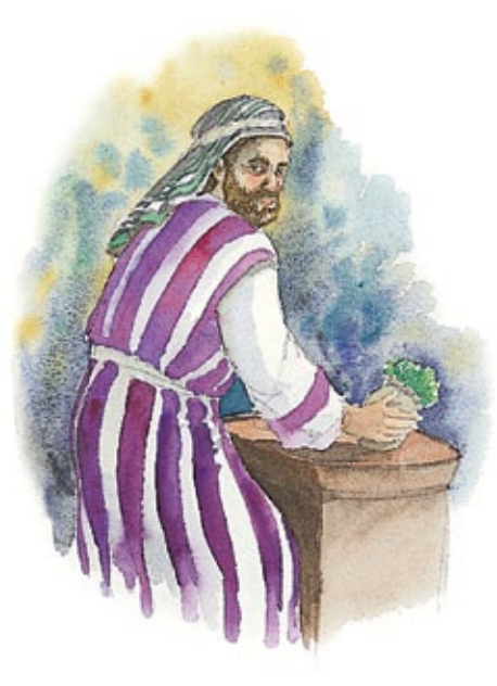
Jesus explained to the Pharisees that although they should tithe, they must not neglect the more important matters of justice, mercy, and faithfulness.