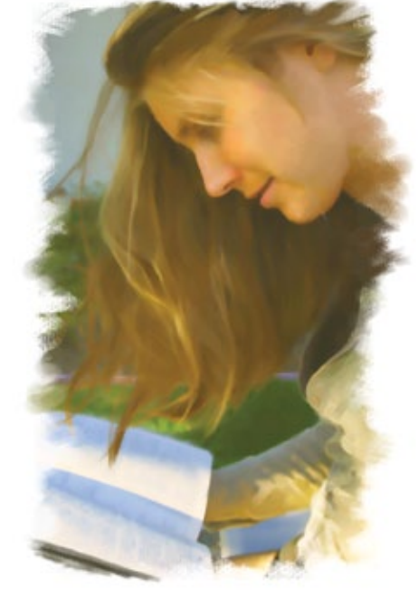
The Holy Spirit guides people to Bible truth.

Answer: The work of the Holy Spirit is to convict me of sin and to guide me into all truth. The Holy Spirit is God's agency for conversion. Without the Holy Spirit, no one feels sorrow for sin, nor is anyone ever converted.