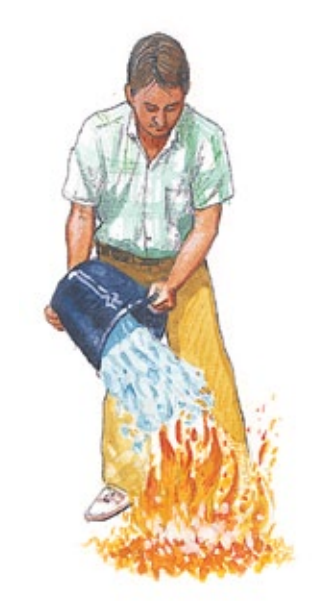
Sin is like water. Continuing in sin puts out the fire of the Holy Spirit.