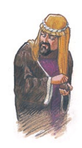
Judas' unpardonable sin was covetousness because he refused to confess and forsake it.

C. The Pharisees' unpardonable sin was refusal to accept Jesus as the Messiah (Mark 3:22-30). They were convinced repeatedly with deep, heartfelt conviction that Jesus was the Messiah—the Son of the living God of heaven. But they hardened their hearts and stubbornly refused to accept Him as Saviour and Lord. Finally they grew deaf to the Spirit's voice. Then one day, after another great miracle by Jesus, the Pharisees told the multitude that Jesus received His power from the devil. Christ at once told them that attributing His miracle-working power to the devil indicated they had passed the point of no return and had blasphemed the Holy Ghost. God could have, and joyfully would have, forgiven them. But they refused until they were stone deaf to the Holy Spirit and could no longer be reached.