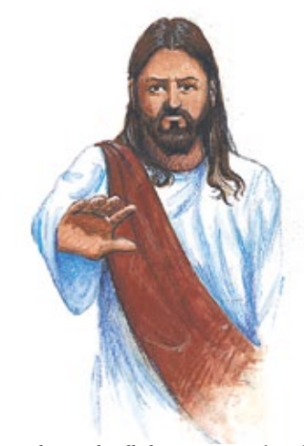
The Lord will shut many professed Christians out of heaven because they refuse to obey Him.

Answer: Those who are crying "Lord, Lord" will be shocked and stunned that they are shut out. They will be absolutely positive that they are saved. Jesus will then doubtless remind them of that crucial time in their lives when the Holy Spirit brought new truth and conviction. It was crystal clear and obviously true. It kept them awake nights, troubled and wrestling over a decision.