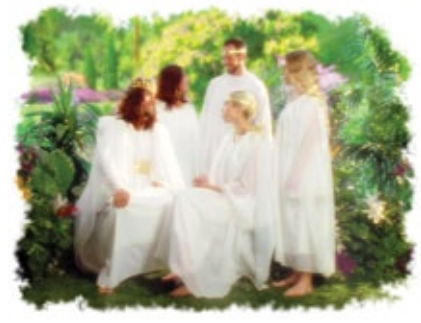
If I make Jesus the Lord of my life, He promises to save me in His kingdom.

As I follow where the Saviour leads, He promises that no one can take me out of His hand (John 10:28) and that a crown of life awaits me (Revelation 2:10). What amazing, glorious, genuine security Jesus gives His followers! Assurance promised under any other conditions is counterfeit. It will lead people to heaven's judgment bar, feeling certain they are saved when they are, in fact, lost (Proverbs 16:25).