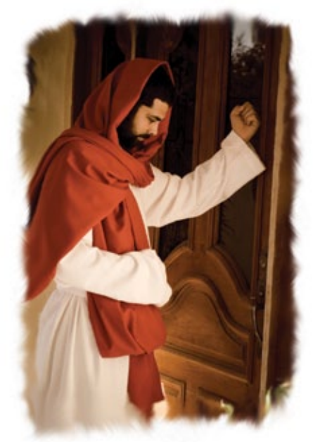
Jesus promises to enter my life when I open the door to Him.