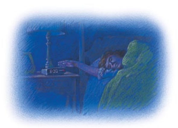
Shutting off an alarm clock instead of getting up will bring me to the place where I no longer hear it. In the same way, shutting off the Holy Spirit will cause me to become deaf to His voice.

Don't Shut Off the Holy Spirit So it is with the Holy Spirit. If I keep shutting Him off, one day He will speak to me and I will not hear Him. When that day comes, the Spirit sadly turns away from me because I have become deaf to His pleadings. I have passed the point of no return. What a solemn, disquieting warning against resisting the Spirit's voice!