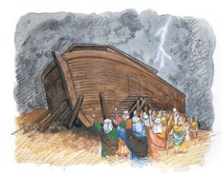
God warned the people in Noah's day that His Holy Spirit would not keep pleading with them forever; nor will He today.

Answer: God solemnly warns that the Holy Spirit does not indefinitely continue pleading with a person to turn from sin and obey God.